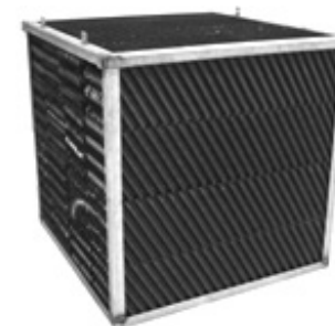
Flopak Media Packs