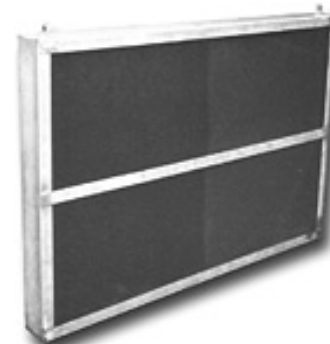
Retpak Media Pack